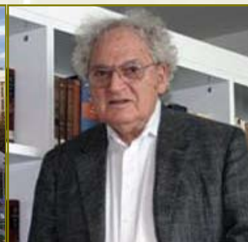
Herbert A. Hauptman, a mathematician, is interested in the development of mathematical methods to determine the structures of substances of biological importance.

More recently, Atlantic Corridor has assisted AIT in developing links for student and faculty exchanges with Daeman College, Upstate New York, Baldwin Wallace College, Ohio and Mesa Community College, Arizona. Athlone Institute of Technology, as a result of a facilitation process undertaken by Atlantic Corridor continues to host and grow the successful Mesa Community College Study Abroad Programme. This programme offers a range of opportunities for student and faculty exchange, giving AIT an international linkage in a growing region in the United States. Mesa Community College (MCC), with 27,000 students, is the largest college in the Maricopa Community College District (MCCD). Located in metropolitan Phoenix, MCCD is the United States largest community college system. Study Abroad in Ireland is part of the International Education program at Mesa Community College. This program offers students the opportunity to accumulate university transferable credits while being immersed in the rich culture of Ireland. Students study history, anthropology, literature, and religious traditions during their time in Ireland, and also take classes in digital media and photography.