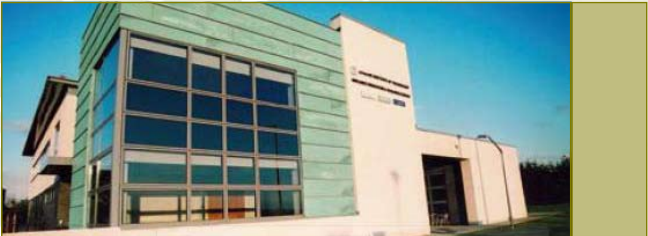
The Midlands Innovation & Research Centre, Athlone, Co. Westmeath.

Balanced economic development and a thriving entrepreneurial culture is the Irish Midlands through international linkages is a key objective for Atlantic Corridor. Through strategic alliances and partnerships, Atlantic Corridor works to encourage new enterprises to develop links that will encourage innovation and access to new markets. In 2008, Atlantic Corridor has worked closely with the Midlands Innovation and Research Centre in Athlone. The Midlands Innovation and Research Centre was established by Athlone Institute of Technology as a converging hub for innovation, research and enterprise in the Midlands. The MIRC provides incubation facilities for innovative and knowledge-based enterprise, an enterprise programme for entrepreneurs and start-ups, and makes available the resources and expertise of the Institute to support client companies. The MIRC assists and advises entrepreneurs and client companies - and provides access to its enterprise network - at every stage of a project's development.